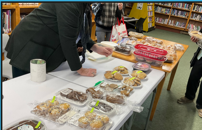
Lockeport Friends of the Library plant and bake sale on May 11 raised $640 for the group. The Friends generously support the library every year.