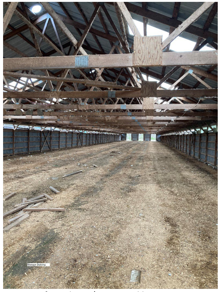
Interior of Warehouse/Storage Buildings