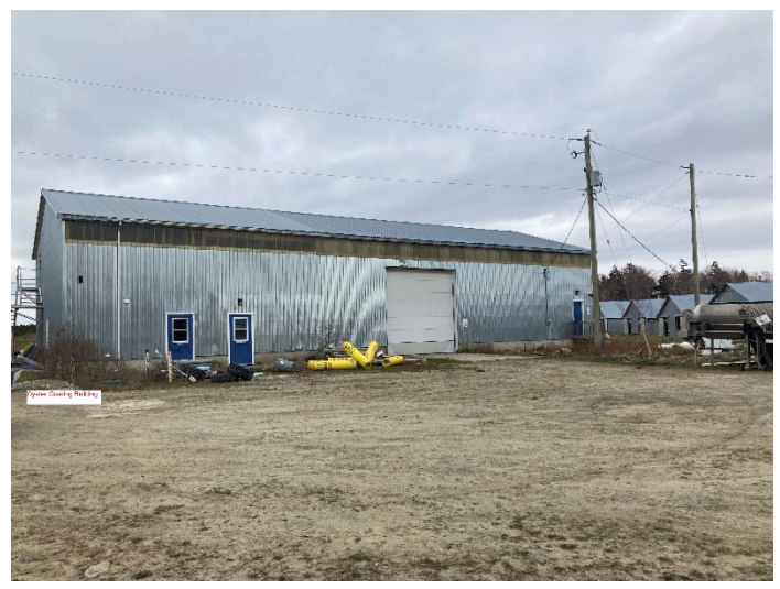
Oyster Grading Building