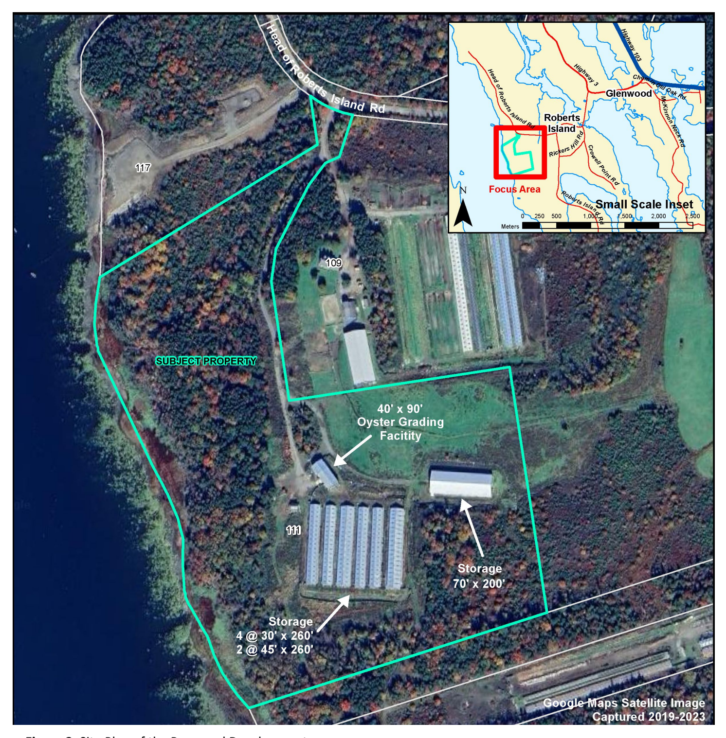
Figure 2. Site Plan of the Proposed Development