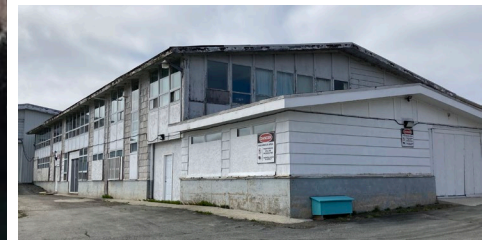
Figure 2. Existing Buildings

Surrounding land uses include low density residential to the north and south, and a mix of low-density residential and undeveloped lands to the east and west. There is an existing easement along the southern property boundary which grants access to the residential properties to the west. The easement will not be impacted by the proposed development.