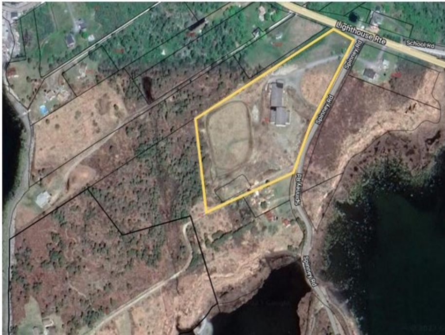
Figure 1. Subject Property