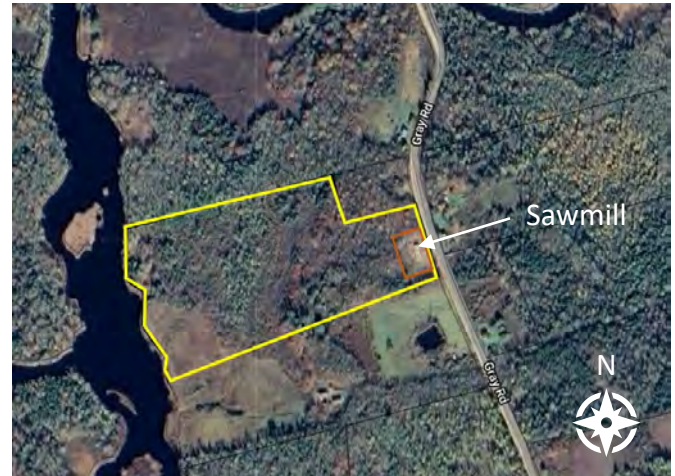
Figure 1. Site Context Map

A portion of the property is cleared and contains an existing sawmill building. The building is approximately 2,000 square feet in area and 13 feet in height, with associated driveway and storage areas. There are no other structures on the property. Vehicle access is provided from Gray Road and the property owner has obtained a permit from NS Public Works for the existing driveway access. The sawmill is currently predominantly used for personal use and occasionally for hire. The remainder of the site is undeveloped.