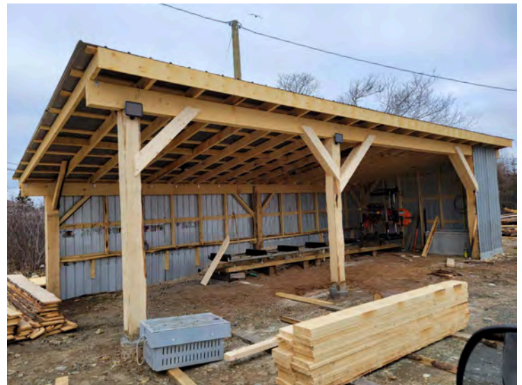
Figure 3: Structure containing sawmill operation.

WSP are proposing a development agreement process to permit a sawmill operation use