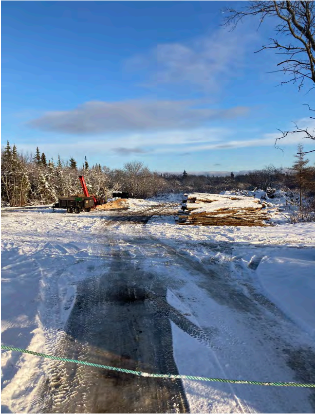
Figure 4: Entrance to site.

The intent of the Coastal Community (CC) Zone is to accommodate an ample supply of diverse residential, commercial, institutional, recreational, agriculture, forestry, and light industrial uses. The lots immediately to the west (across the highway) are currently occupied by residential uses, while lots to the north and south are occupied by light industrial uses.