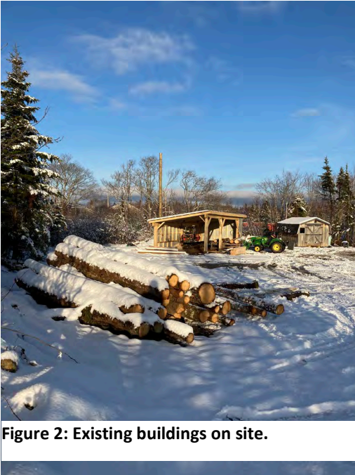
Figure 2: Existing buildings on site.